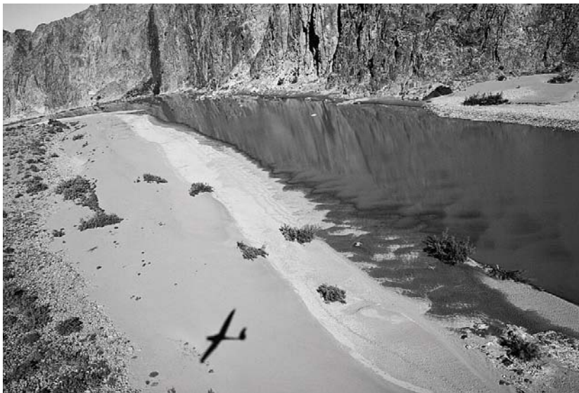
Fish River Canyon - Adriaan and Adri Hepburn (Lambada)