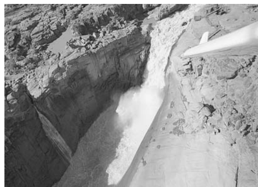
Augrabies Falls