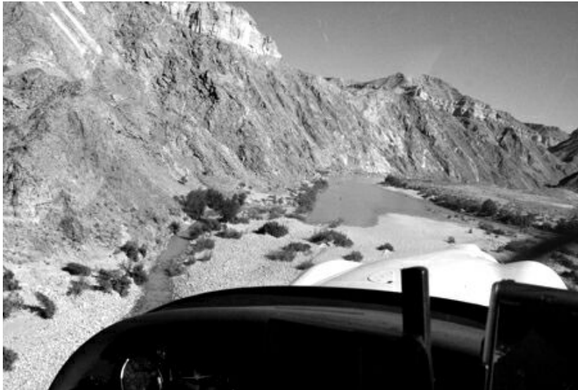
Fish River Canyon - Adriaan and Adri Hepburn (Lambada)